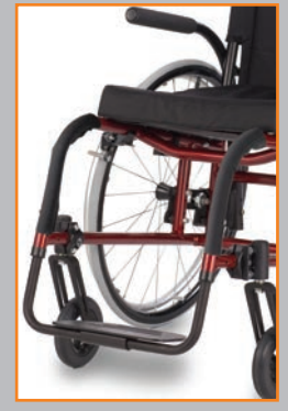
Neoprene Impact Guards