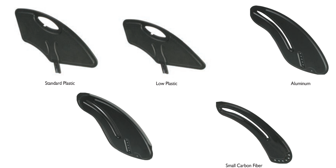
Aluminum with Fender